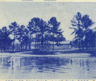
SERVICE BUILDING LAKE THOLOCCO