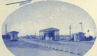
OZARK OUTPOST NUMBER ONE