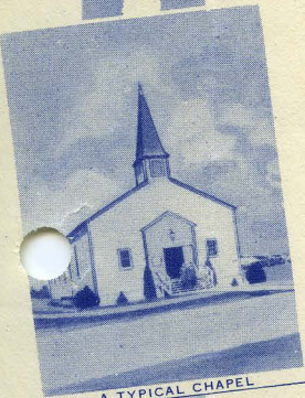
A TYPICAL CHAPEL