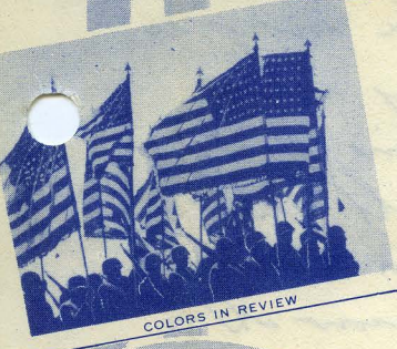
COLORS IN REVIEW