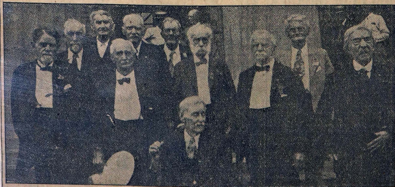
Eleven of those who wore the blue of the Union army during the Civil war attended the celebration of the fiftieth anniversary of the founding of Farragut post, G. A. R., last Sunday at the Memorial Coliseum.