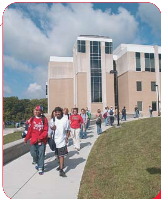
Science and Education Center

Beyond the classroom, students have opportunities to participate in more than 90 organizations offering co-curricular and extra-curricular activities. Special interest clubs, student government, sororities and fraternities, music and drama groups, and other organizations enable the students to enjoy and contribute to campus life.