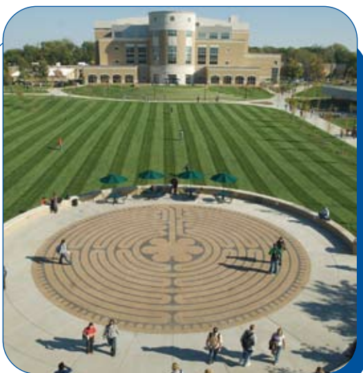
Rice Library & Quadrangle Labyrinth