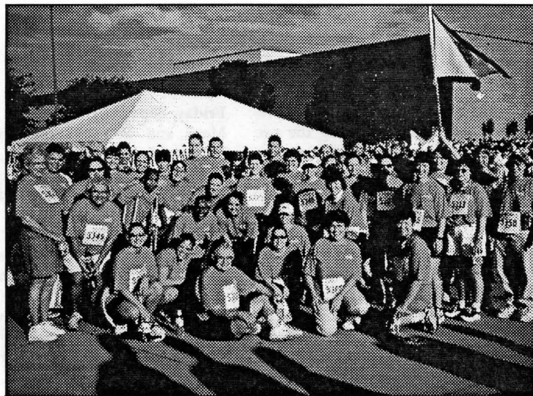
The 2000 USI Race for the Cure team

For current job openings, visit the Human Resources Web site www.usi.edu/hr/ , the Human Resources bulletin boards in the front lobby of the Wright Administration Building and outside the Human Resources office, or call the USI job line, 465-7117.