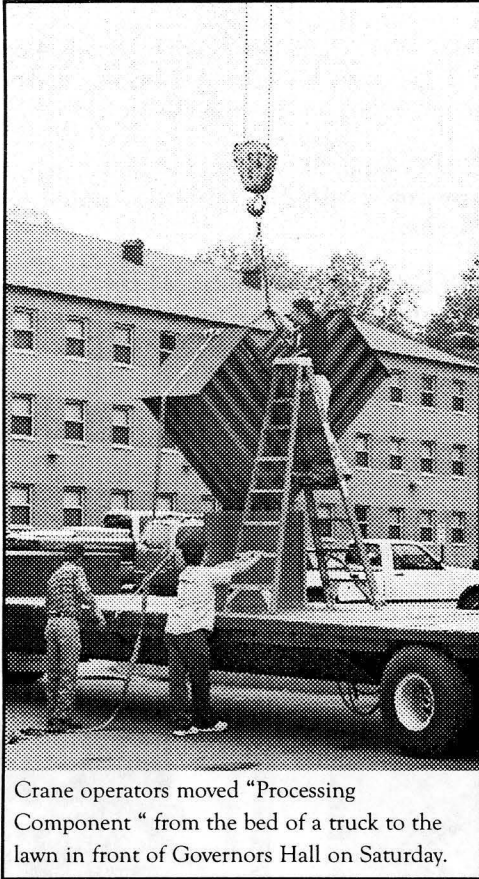
Crane operators moved "Processing Component" from the bed of a truck to the lawn in front of Governors Hall on Saturday.