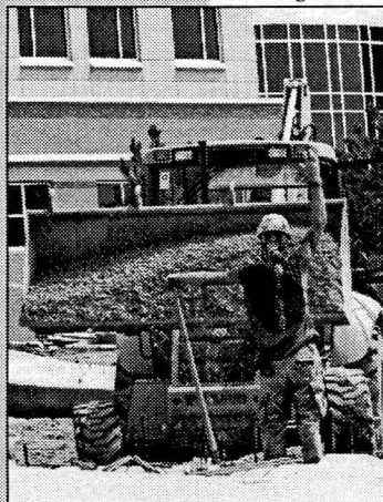
A member of the construction crew signals an equipment operator moving dirt behind the Liberal Arts Center.

“Our students will be able to walk from the parking lots to their classes without crossing traffic,” he explained. “It’s an inconvenience, I know, with all the construction going on, but we need to be able to let our students get on campus safely.”