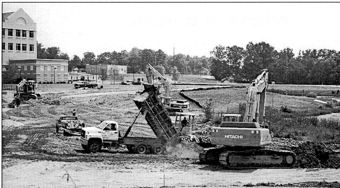
Construction crews are battling the heat and the clock to complete a new section of roadway that will join Bent Twig and Clarke lanes behind the Liberal Arts Center, visible in the top left corner of this photo.