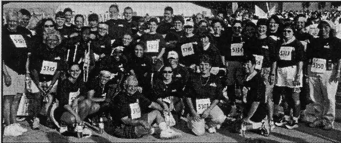
The 2000 USI team poses during Evansville's Race for the Cure.

The University is organizing a team for the 2001 Evansville Komen Race for the Cure, and organizers are making a special effort to include students and alumni.