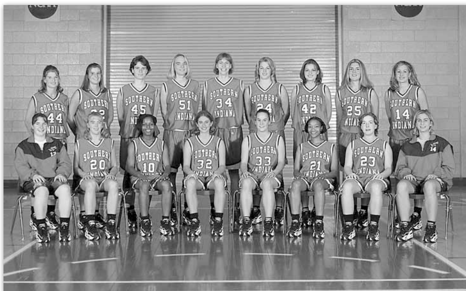
Coming off an appearance in the NCAA II National Championship game the year before, the University of Southern Indiana women's basketball team had no let down in 1997-98. The Eagles went 26-2 overall, 17-1 GLVC, and hosted the NCAA II Great Lakes Regional Tournament for the first in the program's history.