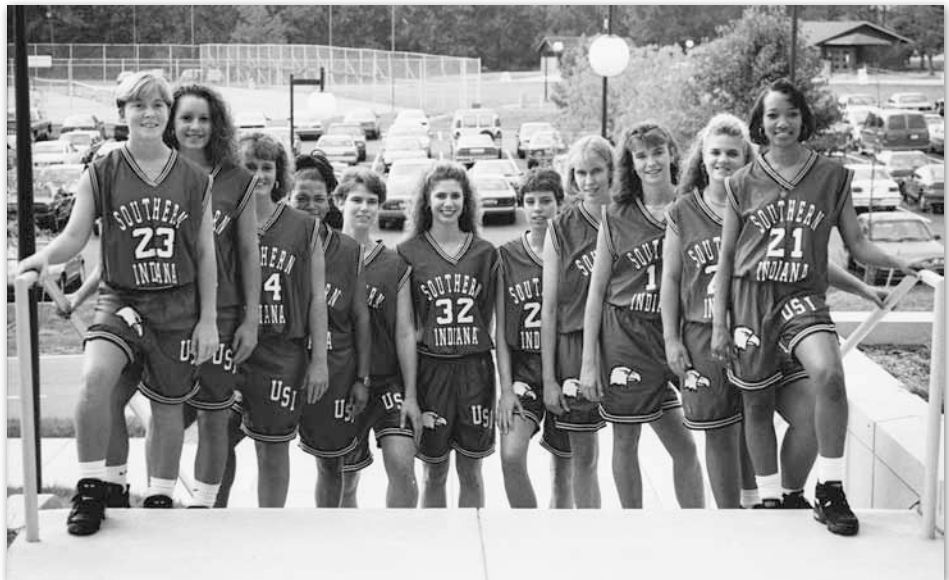
The University of Southern Indiana women's basketball team went 22-7 in 1995-96 as it qualified for the NCAA II Tournament for the second consecutive year. The Screaming Eagles went 16-4 in the GLVC, finishing in a tie for third in the league standings.