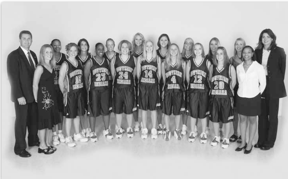
The University of Southern Indiana women's basketball reached the 20-win plateau for the seventh time in 2003-04. The Eagles were 20-10 overall, 12-8 in the GLVC, as they went on to the NCAA II Tournament for the third time in four years.