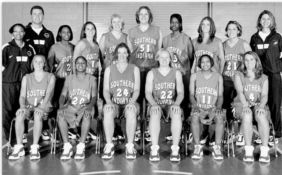
The University of Southern Indiana women's basketball team won its second consecutive GLVC Tournament title in 2001-02. The Screaming Eagles were 27-6 overall, 16-4 GLVC, and hosted the NCAA II Great Lakes Region Tournament for the second time in the program's history.