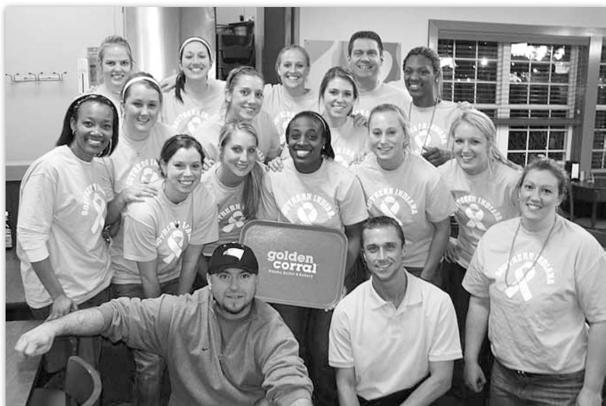
(Above) The 2008-09 women's basketball team held a celebrity server fundraiser at the Westside Golden Corral last spring to benefit local families affected by breast cancer.