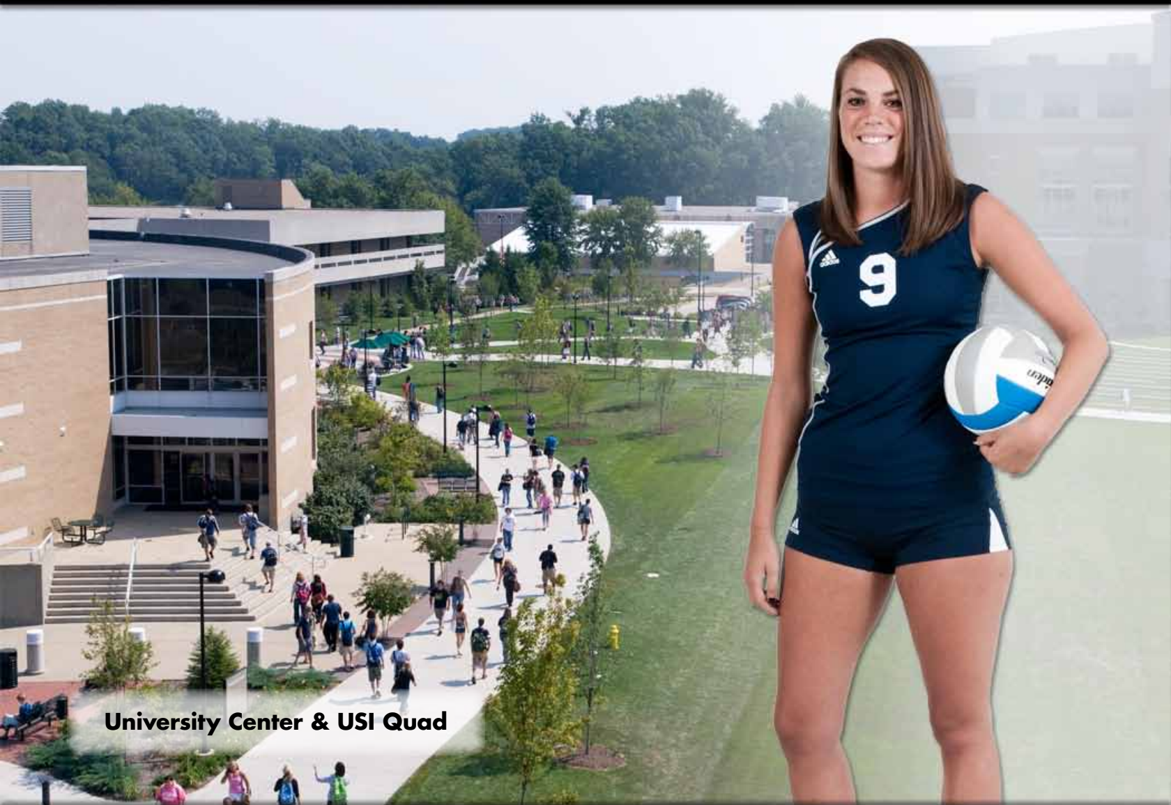
University Center & USI Quad