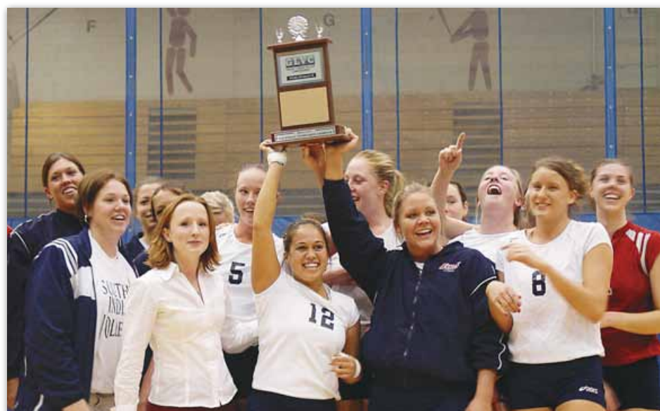
The 2004 Screaming Eagles went 24-7 overall and 15-1 in the GLVC en route to their second conference title and NCAA II Tournament berth in three years.