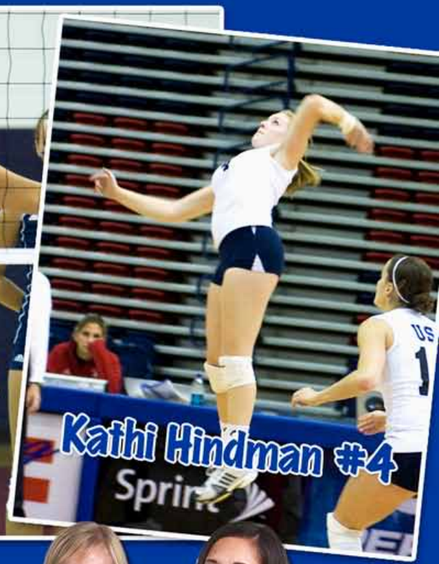
Kathi Hindman #4