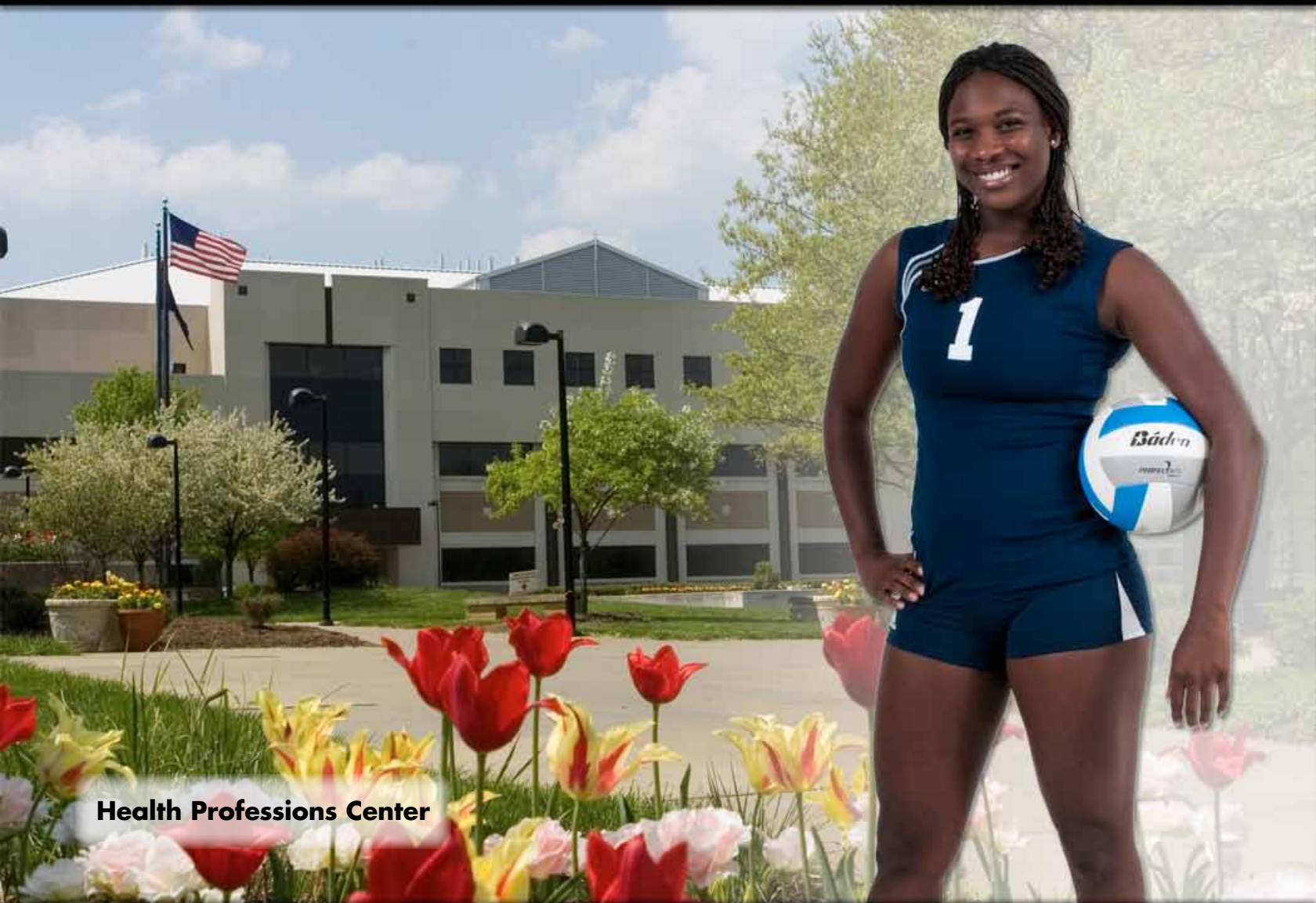
Health Professions Center