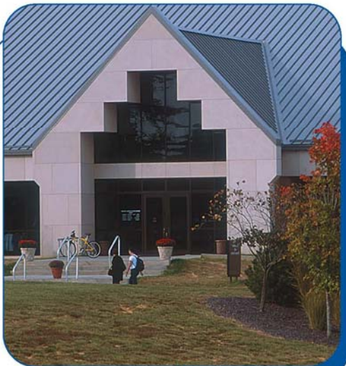
Recreation and Fitness Center