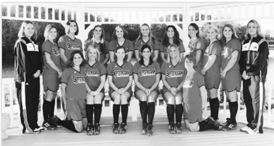
The 2006 USI softball team (above) finished 39-18 overall and 17-5 in the GLVC as it went on to its first NCAA II Tournament appearance since 1998.