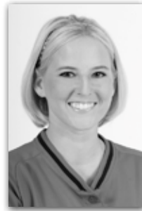
#6 Kambria Current