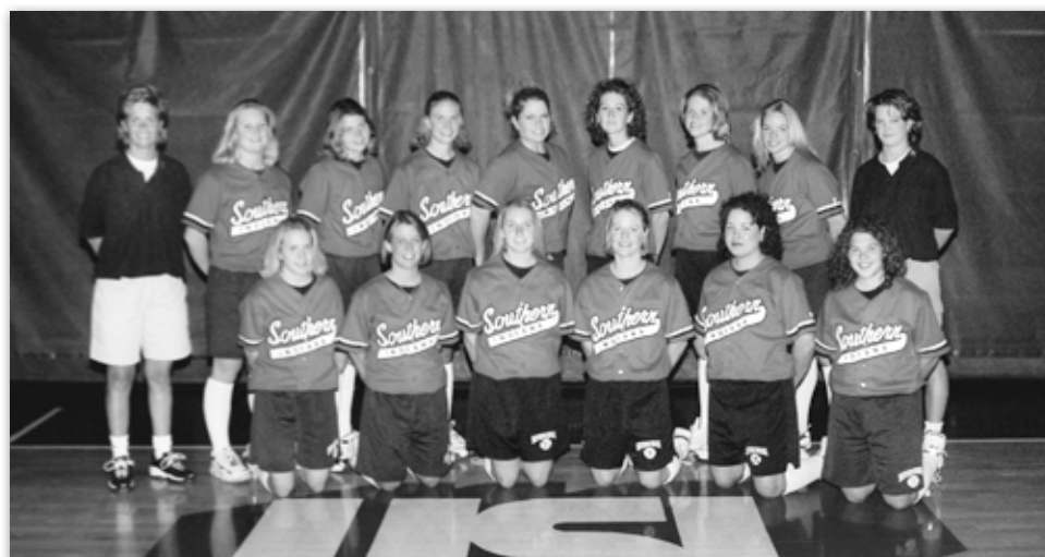
The 1998 USI softball team (above) set a record for wins in a season and winning percentage when it went 48-17 (.758) and took home the GLVC championship.

USI posted a 38-19 record and was 8-0 in league play as it won the GLVC Tournament for the second time in the program's history. The Eagles advanced to the NCAA II Tournament for the first time in 1995.