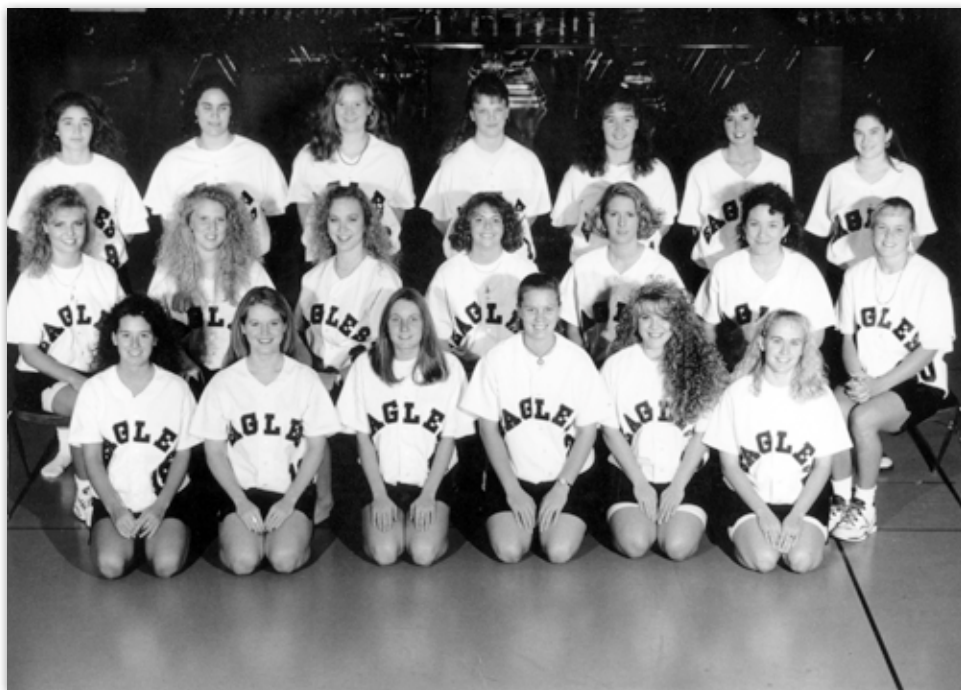
In 1995, the USI softball team entered uncharted waters as it went 38-19 enroute to its second GLVC title and first trip to the NCAA II Tournament. The 38 wins is the third most in the program's 29-year history.