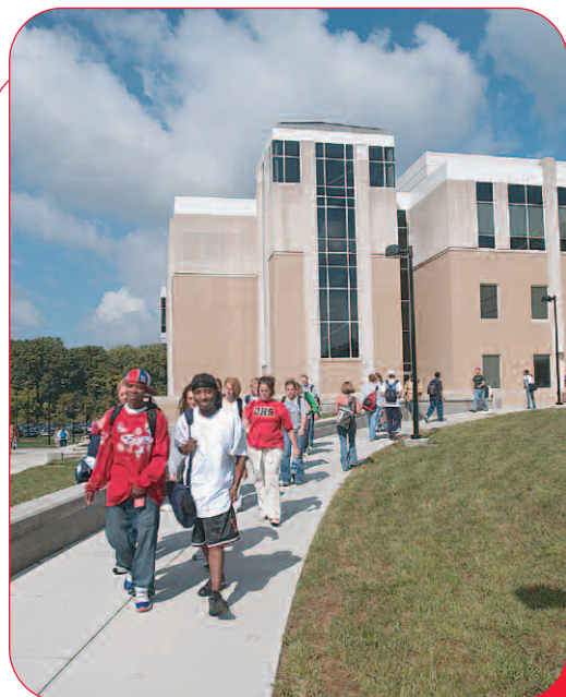
Science and Education Center

Beyond the classroom, students have opportunities to participate in more than 90 organizations offering co-curricular and extra-curricular activities. Special interest clubs, student government, sororities and fraternities, music and drama groups, and other organizations enable the students to enjoy and contribute to campus life.