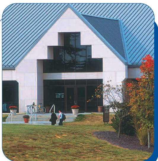
Recreation and Fitness Center