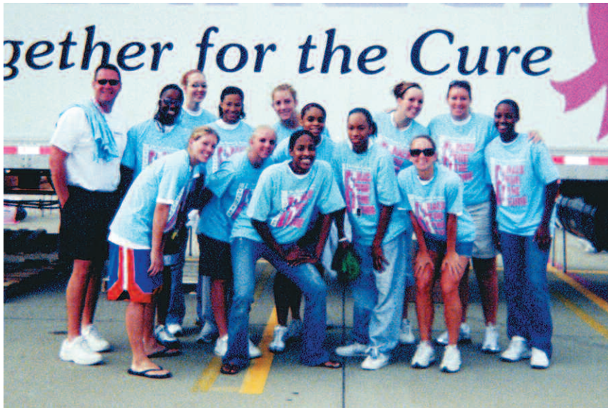
(Above) The USI women's basketball team helps distribute refreshments at the Komen Race for the Cure. Helping with the Race for the Cure is one of many things in which the USI women's basketball program is involved. The Eagles also go to local grade schools to serve as tutors, give free clinics at the YMCA, and help USI students move into residence halls and apartments in the fall.