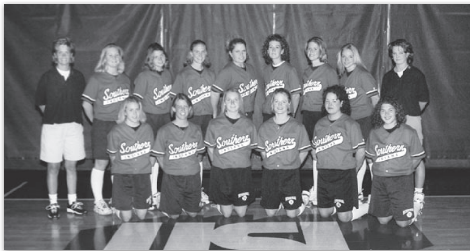
The 1998 USI softball team (above) set a record for wins in a season and winning percentage when it went 48-17 (.758) and took home the GLVC championship.

USI posted a 38-19 record and was 8-0 in league play as it won the GLVC Tournament for the second time in the program's history. The Eagles advanced to the NCAA II Tournament for the first time in 1995.