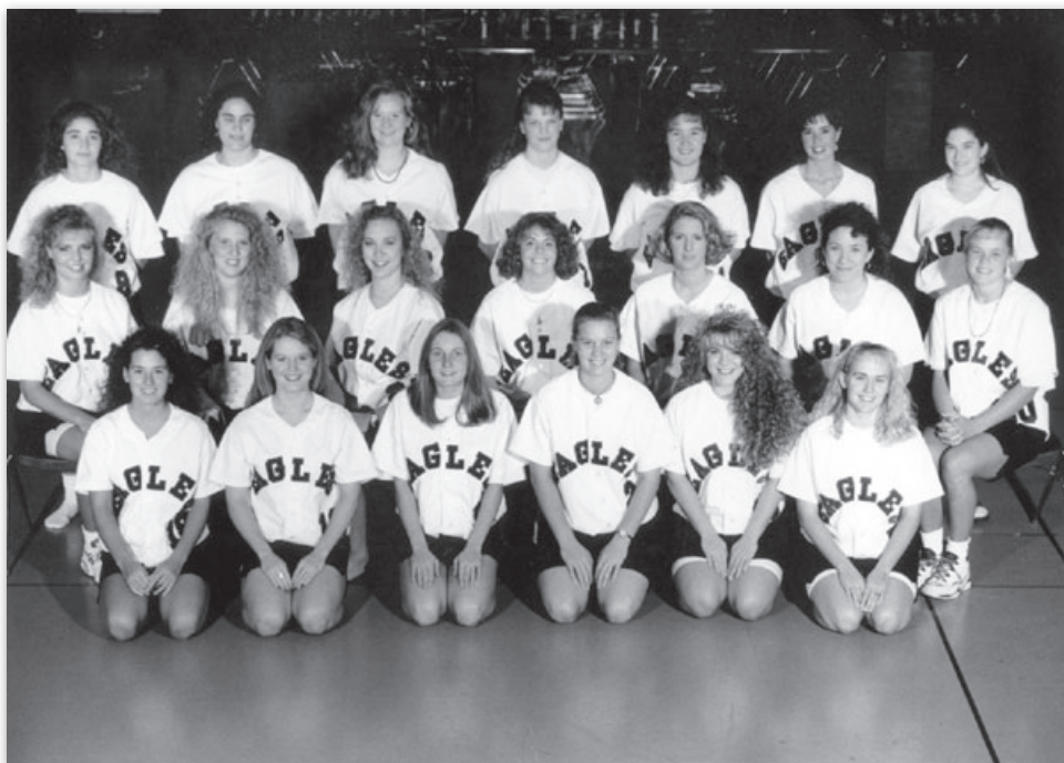
In 1995, the USI softball team entered uncharted waters as it went 38-19 enroute to its second GLVC title and first trip to the NCAA II Tournament. The 38 wins are the third most in the program's 32-year history.