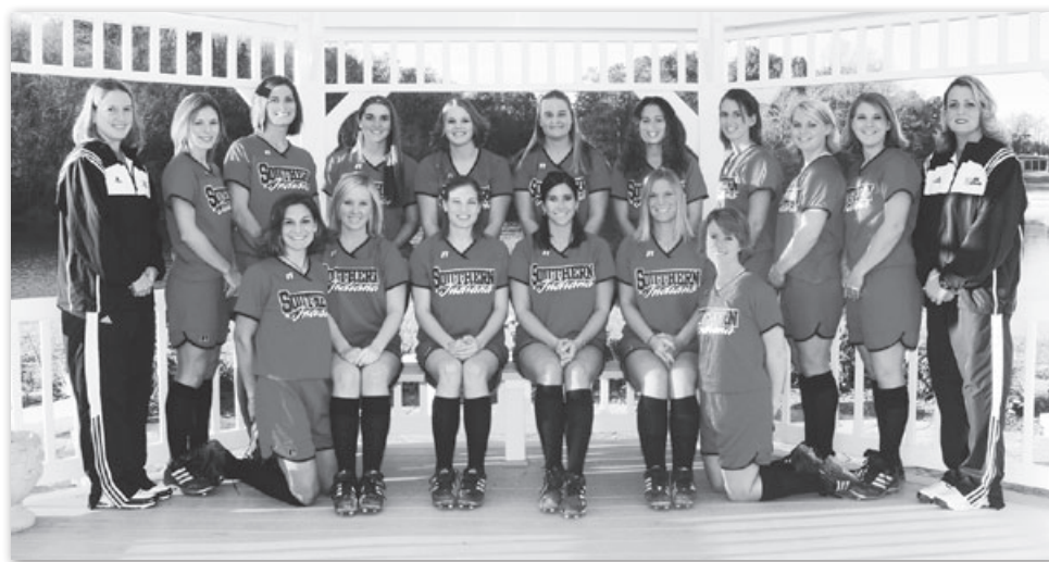
The 2006 USI softball team (above) finished 39-18 overall and 17-5 in the GLVC as it went on to its first NCAA II Tournament appearance since 1998.

3 NCAA II Mid-Atlantic Regional (1995), NCAA II Great Lakes Regional (1998, 2006); 1 GLVC Championship; 2 Record includes two forfeits not recognized by NCAA II.