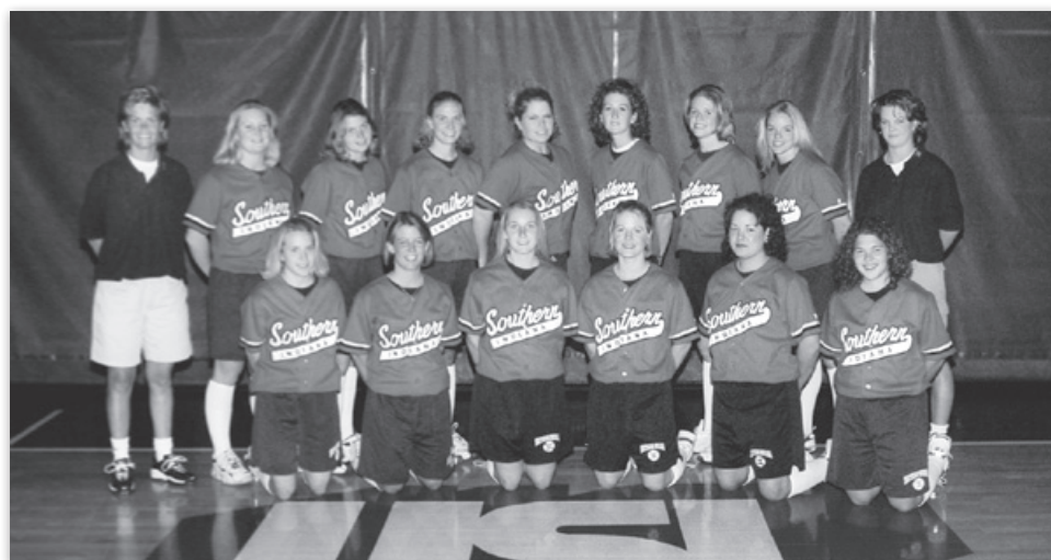
The 1998 USI softball team (above) set a record for wins in a season and winning percentage when it went 48-17 (.758) and took home the GLVC championship.

USI posted a 38-19 record and was 8-0 in league play as it won the GLVC Tournament for the second time in the program's history. The Eagles advanced to the NCAA II Tournament for the first time in 1995.