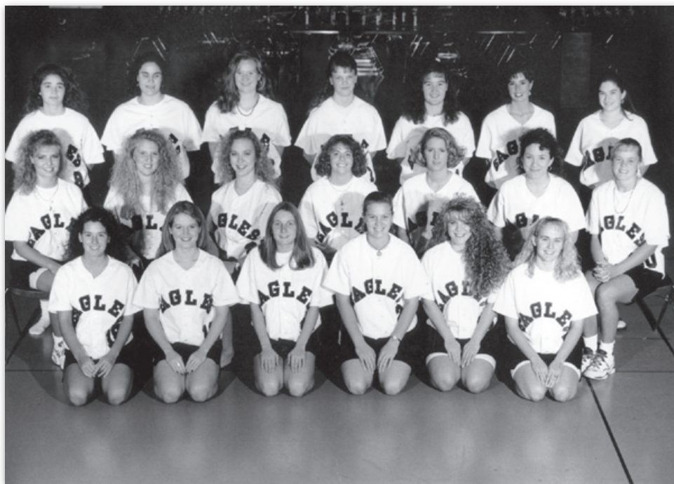
In 1995, the USI softball team entered uncharted waters as it went 38-19 enroute to its second GLVC title and first trip to the NCAA II Tournament. The 38 wins are the third most in the program's 32-year history.