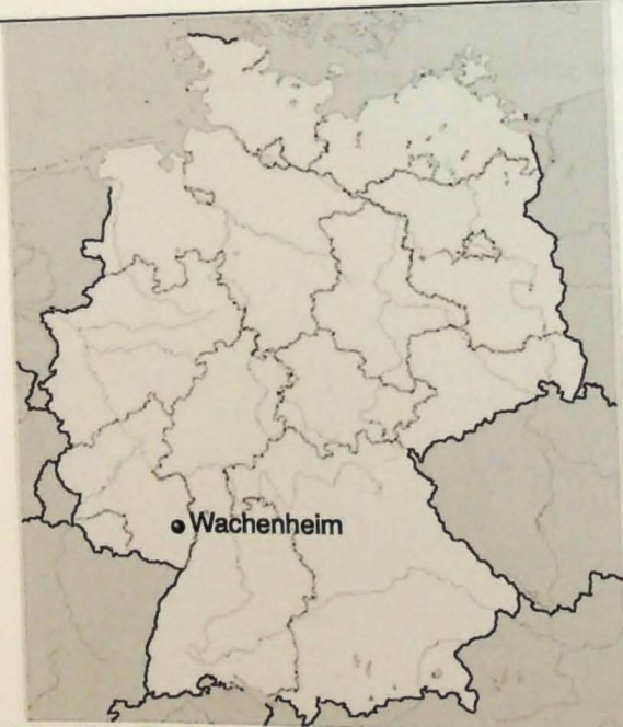
Location of Wachenheim, Rhineland-Palatinate, Germany; Coordinates: 49°26'28"N 8°10'48"E

The town also has a halt on the single-tracked Pfälzische Nordbahn (Neustadt–Monsheim), at which Regionalbahn trains stop according to Rhineland-Palatinate timetabling.