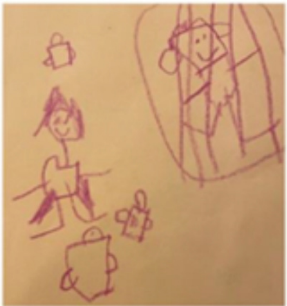
Figure 3. A child's story

Analysis of data also illustrates that children use the presented story characters and some elements of it as a springboard for making stories. For instance, see Figure 3 below. The child created his own version of the Corona Giant story by twisting the plot in his own way. In this picture, the Corona Giant is imprisoned, and the queen and birds are celebrating their victory. It is important to notice here, that the illustrations are solely a product of child's imagination since the story was presented orally without the text. The child "translated" the auditory information onto the paper giving a shape and form to story characters he envisioned in his mind while he listened to the story. These mental representations derived from his previous knowledge and experiences.