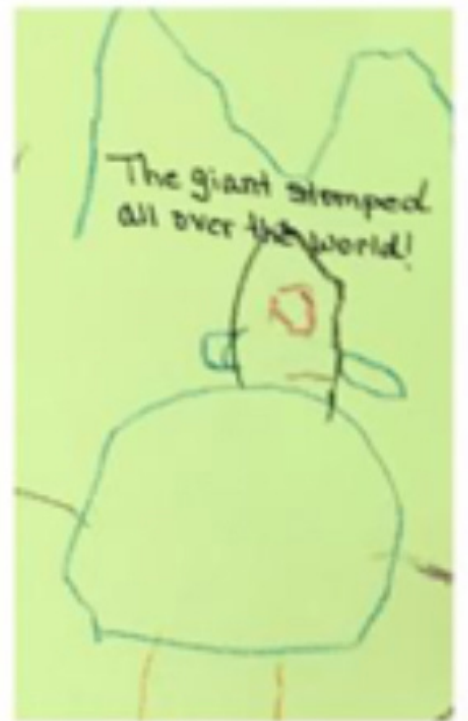
Figure 6. Child's drawing - giant

A giant was the most featured object in the children's drawings. Consistently, the giant was angry or mad as evidenced by the children's wording of "The giant is mad! Something is in his way!"; "The giant is mad! He didn't like the people!"; "The giant stomped all over the world!"; "The giant is walking to the city."; "The giant is being watched by the birds!". The last quotation was the only giant pictured as smiling. All other giants had straight lines for a V shaped mouth, a horizontal line (see Figure 6), or a sad face. A likely correlation to the Corona Giant story was that the birds were helpful to the giant; therefore, the giant was pictured as smiling.