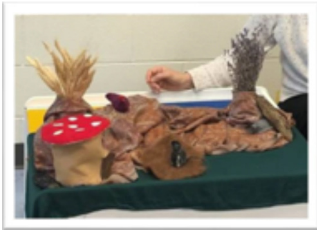
Figure 1. The Little Red Hen characters

importance of hard work and personal initiative. The main characters used in this puppet show – the hen, cat and mouse – were hand-made by team members. Both the cat and mouse were made from wool and the hen was knitted using a wool thread (see Figure 1). The story characters were available to the children afterwards to imitate and play with the puppets.