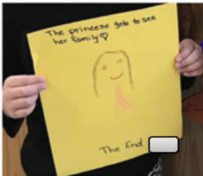
Figure 5. Child's drawing – princess

Four of the drawings collected featured princesses. All princesses were smiling in the drawings. Ideas emerged such as a princess being saved by a knight, the princess getting to see her family (see Figure 5), the princess and her friends, and the princess enjoying the sun. Of interest to our study, was the drawing of a princess getting to see her family. Additional analysis would have been beneficial to determine why the princess was unable to see her family. Was the princess in quarantine which would have mimicked reality or was the princess, as often pictured in fairytales, captured and waiting to be rescued?