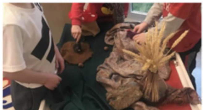
Figure 2. Children presenting The Little Red Hen

Storytelling makes children story makers, story tellers and story actors. Children in this classroom always engaged in various pretend play activities using prompts in dramatic play area. It was observed, however, that storytelling intervention provokes children to play with the story prompts and imitate the observed presentation. Having a shared play idea, stemmed from the story plot, provides a topic for conservation motivating children to socialize, engage, construct scenarios elevating their play to mature level that results in learning (Bodrova & Leong, 2008). It became visible that storytelling intervention provokes children to play with the story prompts and imitate the observed presentation. The concrete prompts and story table setting provide some direction inexplicitly making the children storytellers. These items were intentionally left in the setting during phase 1 to encourage interaction and retelling of stories. Engaged in dialoguing with each other (see Figure 2) they either repeated the same plot or come up with their own remarks for the characters. Children carry their ideas on into their dramatic play and the story continues to evolve and change including new toys, materials, and players. The conversation enhanced social interaction and communication among children.